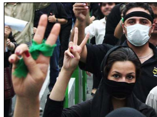
Iranian voters demonstrate in support of Mir-Hossein Mousavi in June.

Reporting has also continued on post-election developments, including the inauguration of President Ahmadinejad, the trials of protesters, the crackdown by authorities on reformists and reformist publications, and the