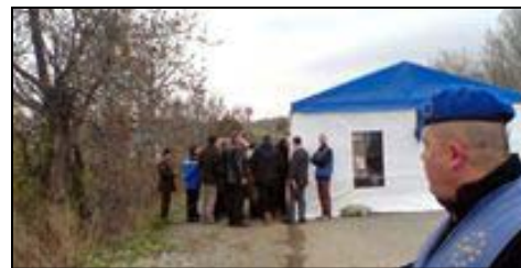
EU monitors watch Georgia’s de facto border with South Ossetia from the Georgia side.

Marking the anniversary of the August 2008 Russia-Georgia conflict, RFE/RL explored the impact of the war from a variety of angles. Reporters traveled around the country to talk to survivors, while analysts discussed the impact of the war on Georgians, on the political fortunes of President Saakashvili, and on the roles of NATO and the EU in the region.