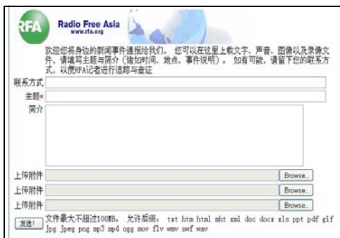
RFA Mandarin’s digital dropbox. The text informs users to upload text, audio, video or image files to help inform RFA’s reporting.

RFA Mandarin’s new “add comment” box at the end of online report has generated heated discussions, particularly on reports about the Xinjiang unrest. RFA Mandarin also launched, in July, an electronic “drop box” for citizen journalists. Within 48 hours of its installation, RFA received two story leads, which were verified and aired.