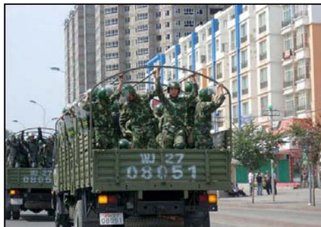
Armed police move into Urumqi in transport trucks on July 8. (RFA Cantonese/Hailan)

RFA's Uyghur, Mandarin, Cantonese and Tibetan services worked together to provide reports from all over China. The services broadcast daily, in-depth coverage of the situation, including breaking the story of the disappearance of an outspoken Uyghur economist, Ilhan Totsi. RFA's eyewitness coverage was cited by major international news sources like the AP and Wall Street Journal .