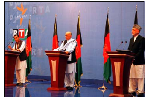
(Left to right) Ramzan Bashardost, Ashraf Ghani and Hamid Karzai participate in a debate co-sponsored by RFE/RL.

In advance of and during the August 20 Afghan elections, RFE/RL and VOA brought the Afghan people expert analysis, profiles of the many candidates, and reports on local sentiment from all over the country.