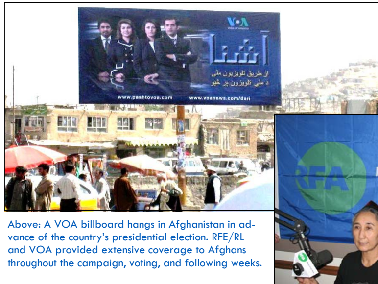
Above: A VOA billboard hangs in Afghanistan in advance of the country's presidential election. RFE/RL and VOA provided extensive coverage to Afghans throughout the campaign, voting, and following weeks.

Below: Rabiya Kadeer, the World Uyghur Council president who was blamed by China for inciting riots, speaks with RFA.